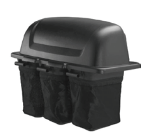
TRIPLE BAGGERS (TRACTOR)